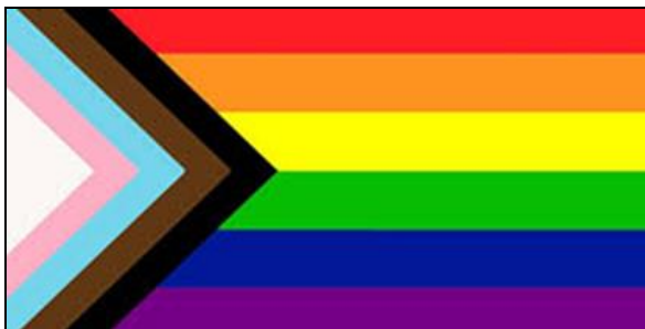
PROGRESSIVE PRIDE FLAG, DESIGNED IN 2018 BY DANIEL QUASAR THIS FLAG INCORPORATES BOTH THE PRIDE AND THE TRANSGENDER FLAGS AND ACKNOWLEDGES THOSE WHO ARE BLACK, INDIGENOUS OR PEOPLE OF COLOUR