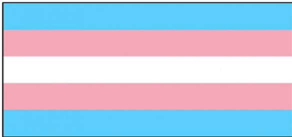
THE TRANSGENDER FLAG, DESIGNED IN 1999 BY MONICA HELMS THE THREE COLOURS REPRESENT BABY BLUE FOR BOYS, BABY PINK FOR GIRL AND WHITE FOR THOSE WHO ARE TRANSITIONING, INTERSEX OR CONSIDER THEMSELVES AS HAVING AN UNIDENTIFIED GENDER

It will help our planning if you are able to complete a Survey Monkey questionnaire that will be posted soon. All are welcome to participate.