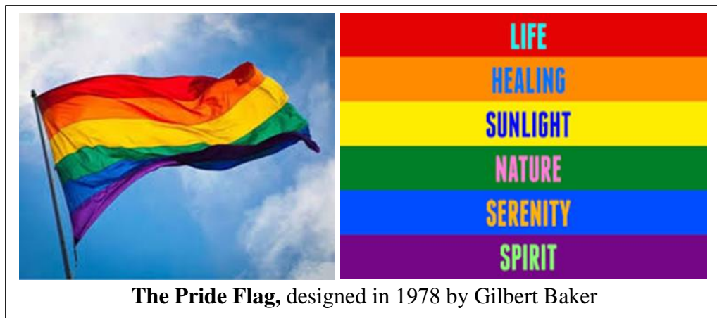
The Pride Flag , designed in 1978 by Gilbert Baker

By the end of 2020 there were more than 34 Affirming Churches in Alberta and more than 220 in Canada; more than 100 United Churches across Canada were in the process of becoming Affirming. As